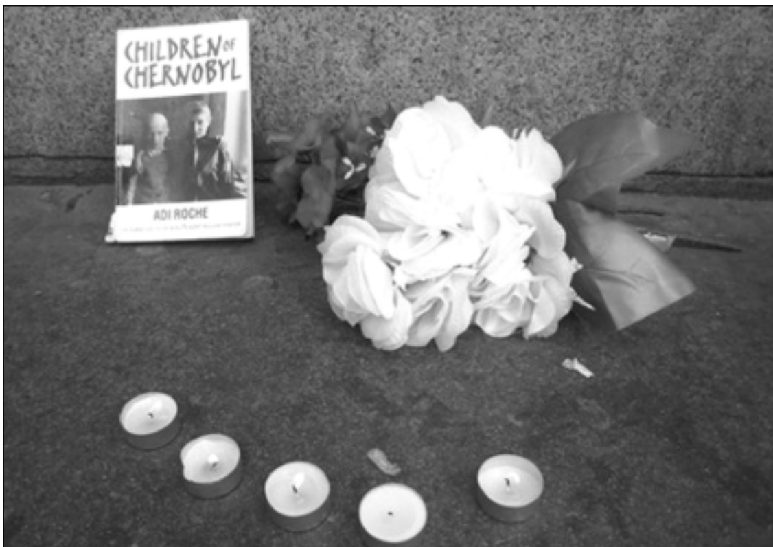
A floral and candle tribute