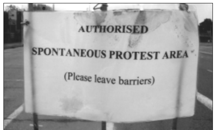
MoD police 'authorised' a previous protest at Aldermaston as you can see

Please specify which day of the week you prefer, and which weeks you would be available to cover.