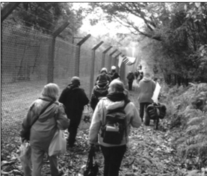
Procession round the perimeter at Aldermaston.

I t was several months in the planning and on 27th October it was done. Did we stop developing nuclear weapons on that day? Well no, life is back to normal at Aldermaston, and the work goes on.