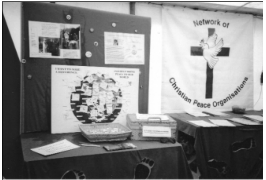
Our display in the Peace Tent.