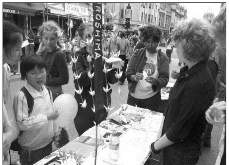
Making paper cranes in Oxford.