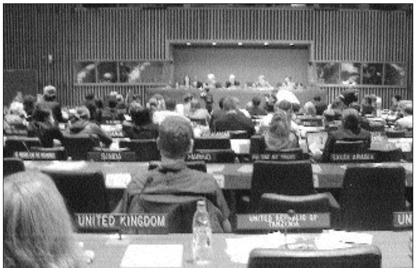
The PrepCom of 2009 ... rather more hopeful than previous years!

The Aldermaston Blockade is on 15 February. We are involved in helping organise a 'Faiths Gate' (which we hope will be Interfaith) and have been in regular contact with other organisations to facilitate maximum publicity and participation. We decided that an overnight vigil would be a useful addition to the blockade, realising that not all CCND supporters would want to attend a blockade with a risk of arrest (although it is perfectly possible to participate as an observer), so the vigil offers a reasonable alternative; the vigil was a popular option at the previous Aldermaston event last October.