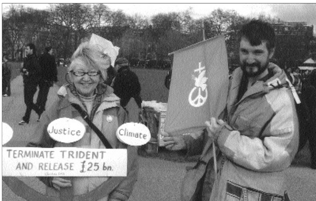
Making links... CCND Exec Members at the G20 March and Rally in March this year. We say: spend the money on saving the planet!

If you would like a copy of the minutes and the annual reports, including the financial report, please let us know. Alternatively they will be available to download from the website shortly.